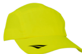
2001 - AM FL