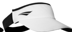
1000 - BC