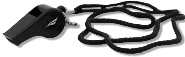
9000 - PT