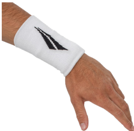
1000 - BC