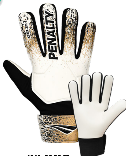
1340 - BC-DR-PT