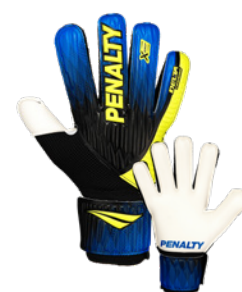
9340 - PT-AZ-VD