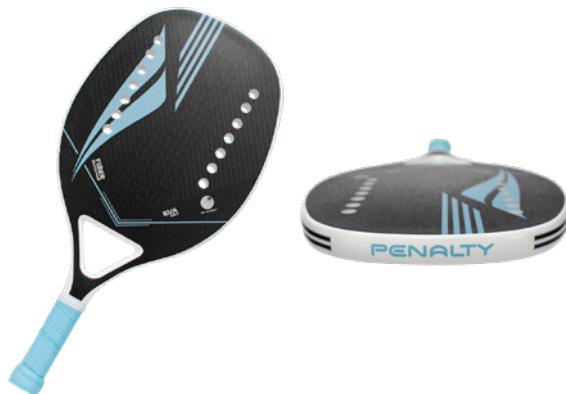
9380 - PT-AZ-BC