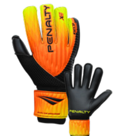
3130 - LJ-AM-PT