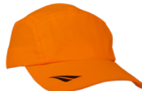
3002 - LJ FL