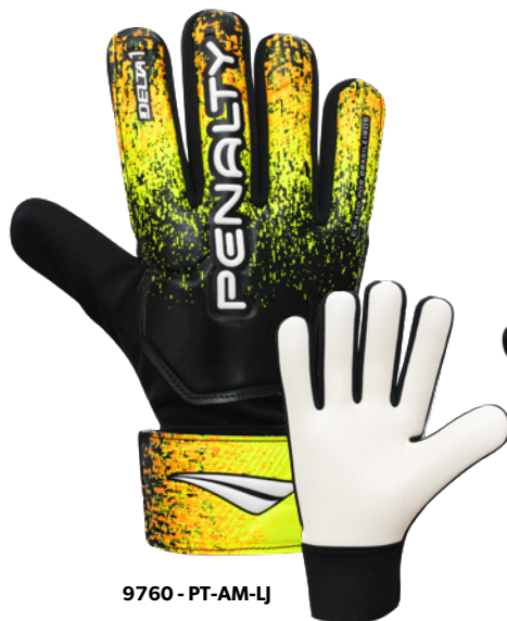
9760 - PT-AM-LJ