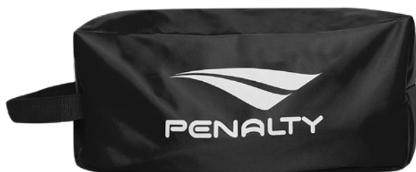
9000 - PT