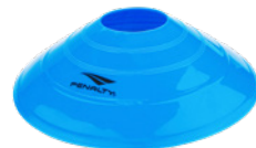
6000 - AZ