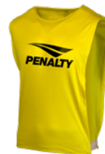
2000 - AM