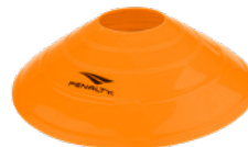
3000 - LJ