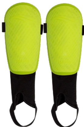
2000 - AM