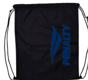
9042 - PT-RY