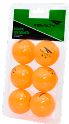
3000 - LJ