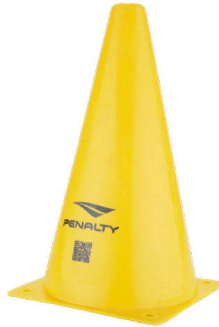
2000 - AM