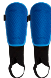
6003 - RY