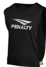
9000 - PT