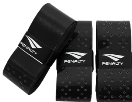
9000 - PT