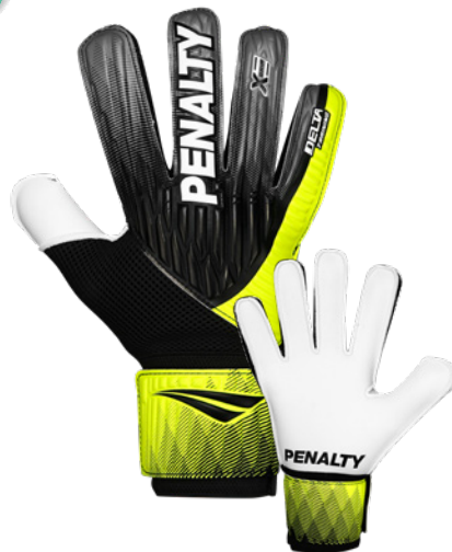
9123 - PT-CH-AM