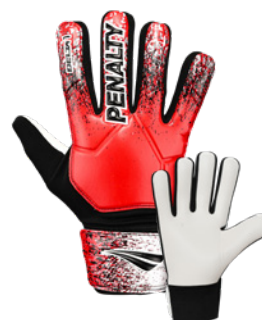
4421 - VM-PT-PR