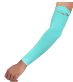
5094 - AQ