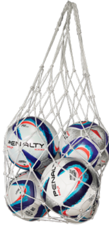
9990 - DI-VE-R