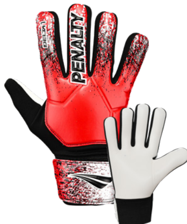
4421 - VM-PT-PR