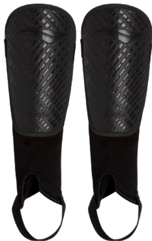
9000 - PT