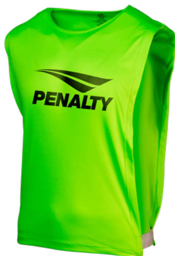
5072 - VD FL