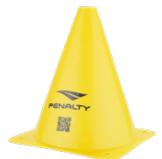
2000 - AM