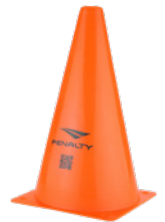
3000 - LJ