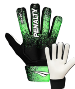
9412 - PT-VM-CH