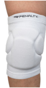
1000 - BC