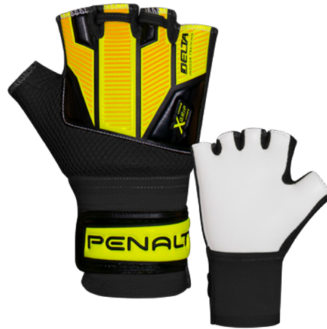
9302 - PT-AM-CH