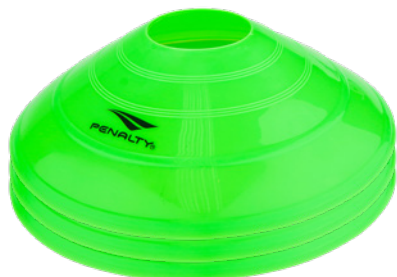
5000 - VD