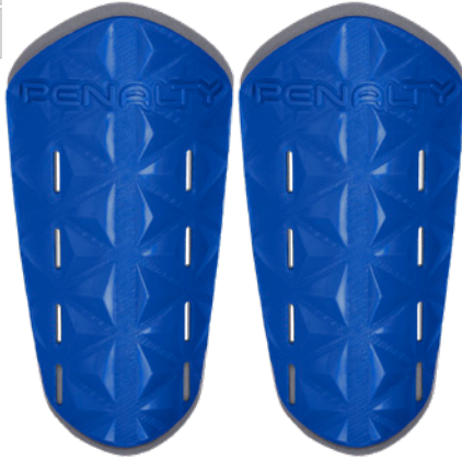
6000 - AZ