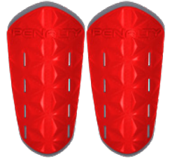
4000 - VM