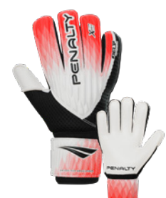
1610 - BC-VM-PT