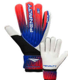
6250 - AZ-VM-BC