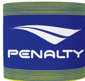
6102 - RY-AM FL