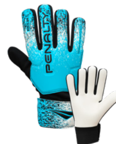
6250 - AZ-VM-BC