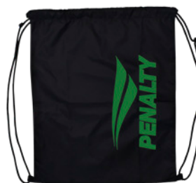
9400 - PT-VD