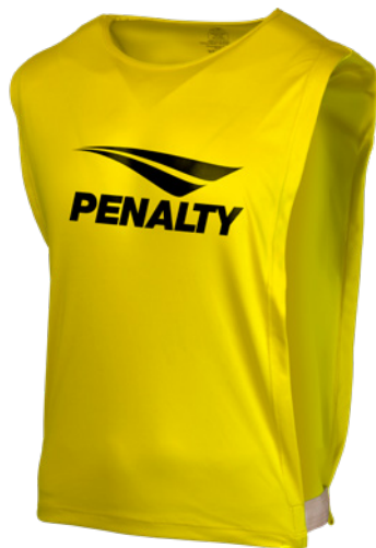
2000 - AM