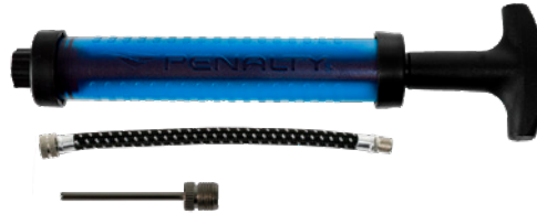
6000 - AZ