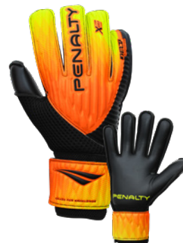
3130 - LJ-AM-PT