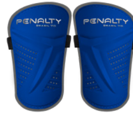
6700 - AZ-CZ