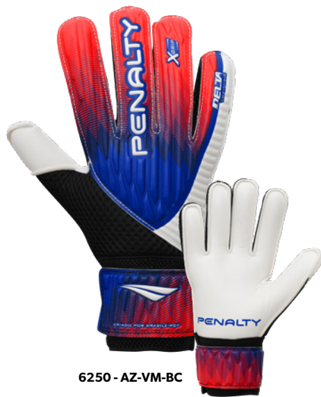
6250 - AZ-VM-BC