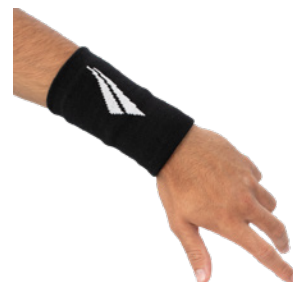
9000 - PT