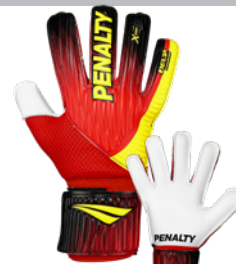
4420 - VM-PT-AM