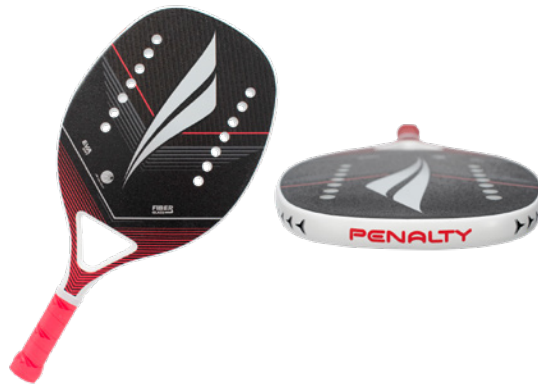
9580 - PT-VM-BC