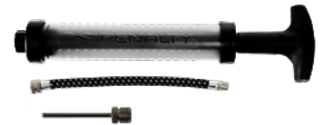
1000 - BC