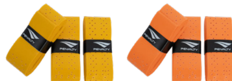
2000 - AM