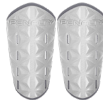
1000 - BC