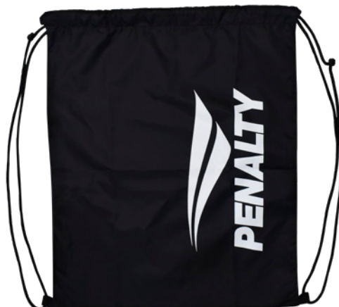
9800 - PT-BC