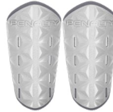
1000 - BC