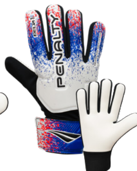
1070 - BC-AZ-VM