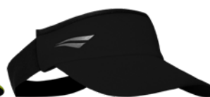
9000 - PT