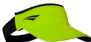
2001 - AM FL