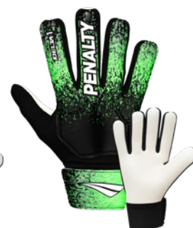
9412 - PT-VM-CH