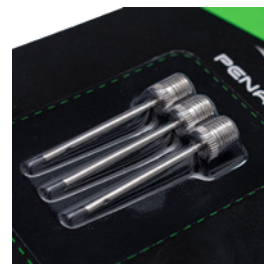
9990 - DI-VE-R