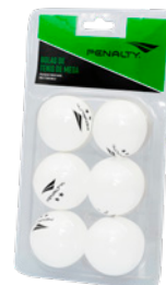
1000 - BC