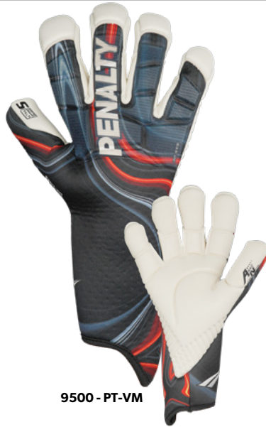
9500 - PT-VM

TECHNOLOGIES ARACNUN / ANATOMIC SYS / THUMB WRAP / CURVE FIT / FLOT