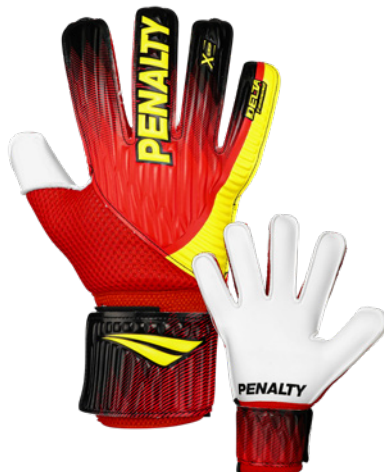
4420 - VM-PT-AM