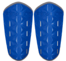
6000 - AZ