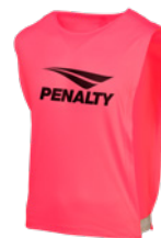
7161 - RS FL