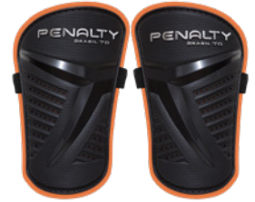
9600 - PT-LJ