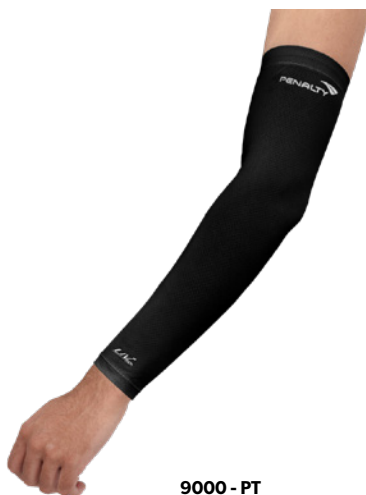
9000 - PT

TECHNOLOGIES PROTECTION UV,NANO FRESH,DRY