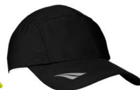
9000 - PT