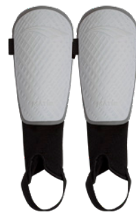
1200 - BC-CZ