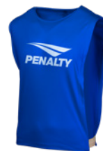
6003 - RY