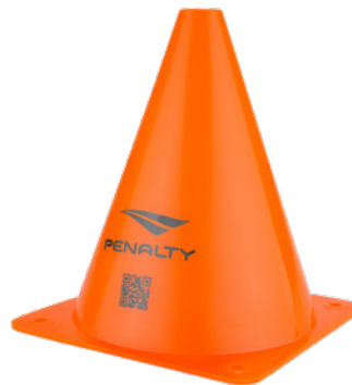
3000 - LJ