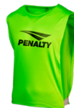
5072 - VD FL