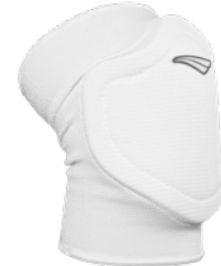
1000 - BC