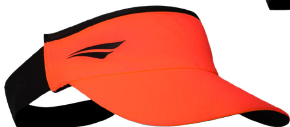
3002 - LJ FL