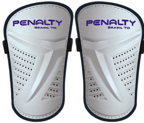
1110 - BC-PT