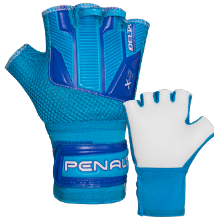
9302 - PT-AM-CH