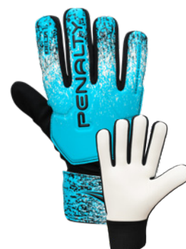
6250 - AZ-VM-BC