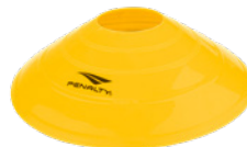
2000 - AM