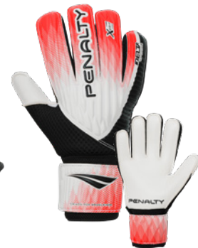
1610 - BC-VM-PT