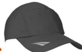
8001 - CH