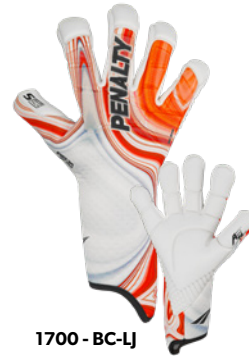
1700 - BC-LJ