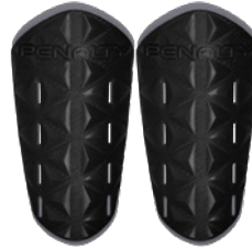
9000 - PT