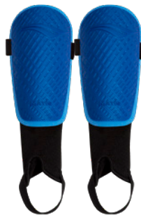
6003 - RY