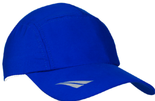
6003 - RY