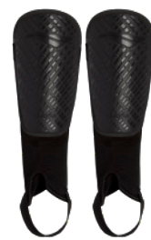
9000 - PT