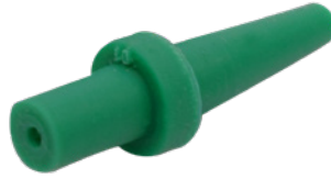
5000 - VD