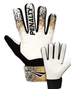
1340 - BC-DR-PT