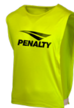
2001 - AM FL