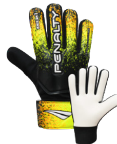
9760 - PT-AM-LJ