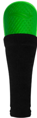
9000 - PT