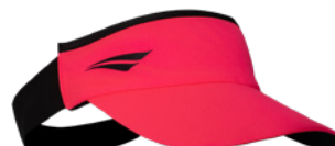
7690 - PK