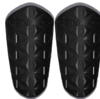
6000 - AZ