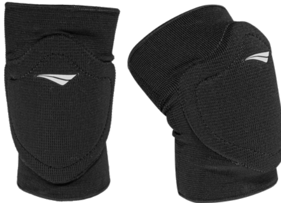
9000 - PT