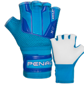
6500 - AZ-BC