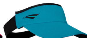
6000 - AZ