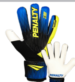
9340 - PT-AZ-VD