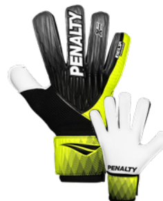
9123 - PT-CH-AM