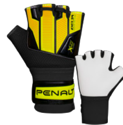
6500 - AZ-BC