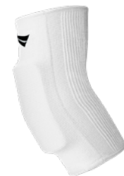
1000 - BC