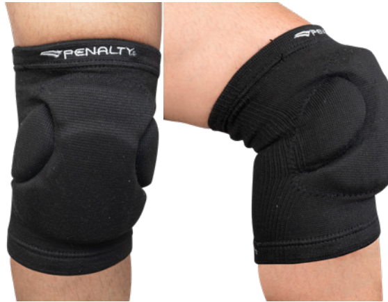
9000 - PT

TECHNOLOGIES SHIELD SYS; HIGH COMPRESS; ANATOMIC SYS