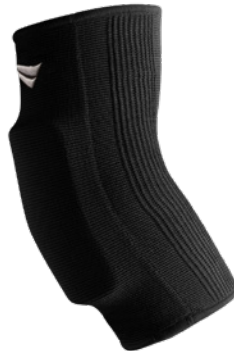
9000 - PT